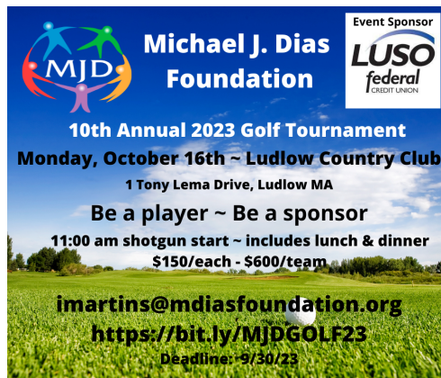
Register to Golf

With a monthly donation, you become an honored member of our Fellowship Club and you will help ensure that those in recovery have a safe, supportive place in which to live.